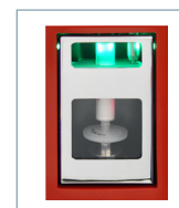
Less than 50ppm

FIJI is the only test that can screen for all types of FAME.