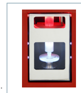
More than 50ppm